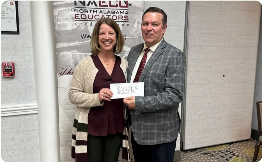
We donated $3326.00 to Kids To Love and $1921.00 Huntsville Hospital Foundation!