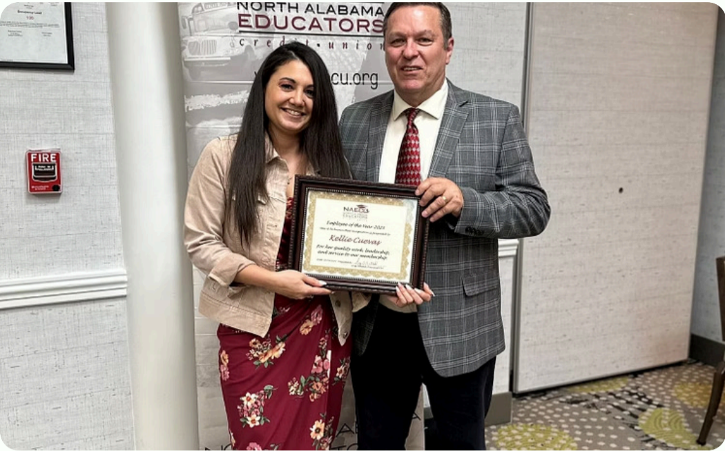
Congrats on Employee of the Year!