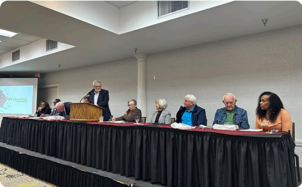
We heard our yearly recap from our board!