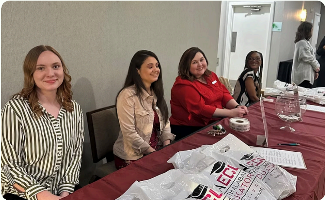
NAECU employees happy to see our members!