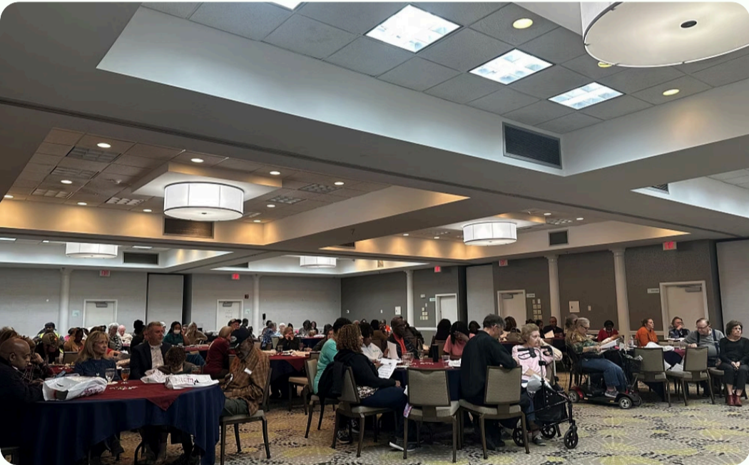
We had around 100 members attend and their families!